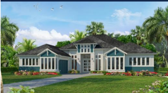
THE COASTAL MODERN - TILE

Living Area: 3,495 ft 2 Under Roof: 5,059 ft 2