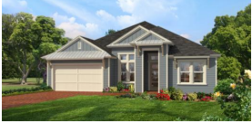
THE COASTAL MODERN - TILE