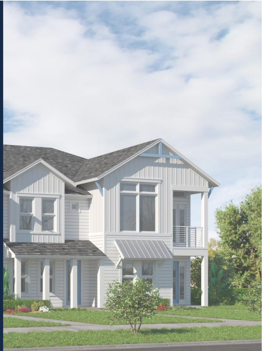
THE CASTILLO - FARMHOUSE