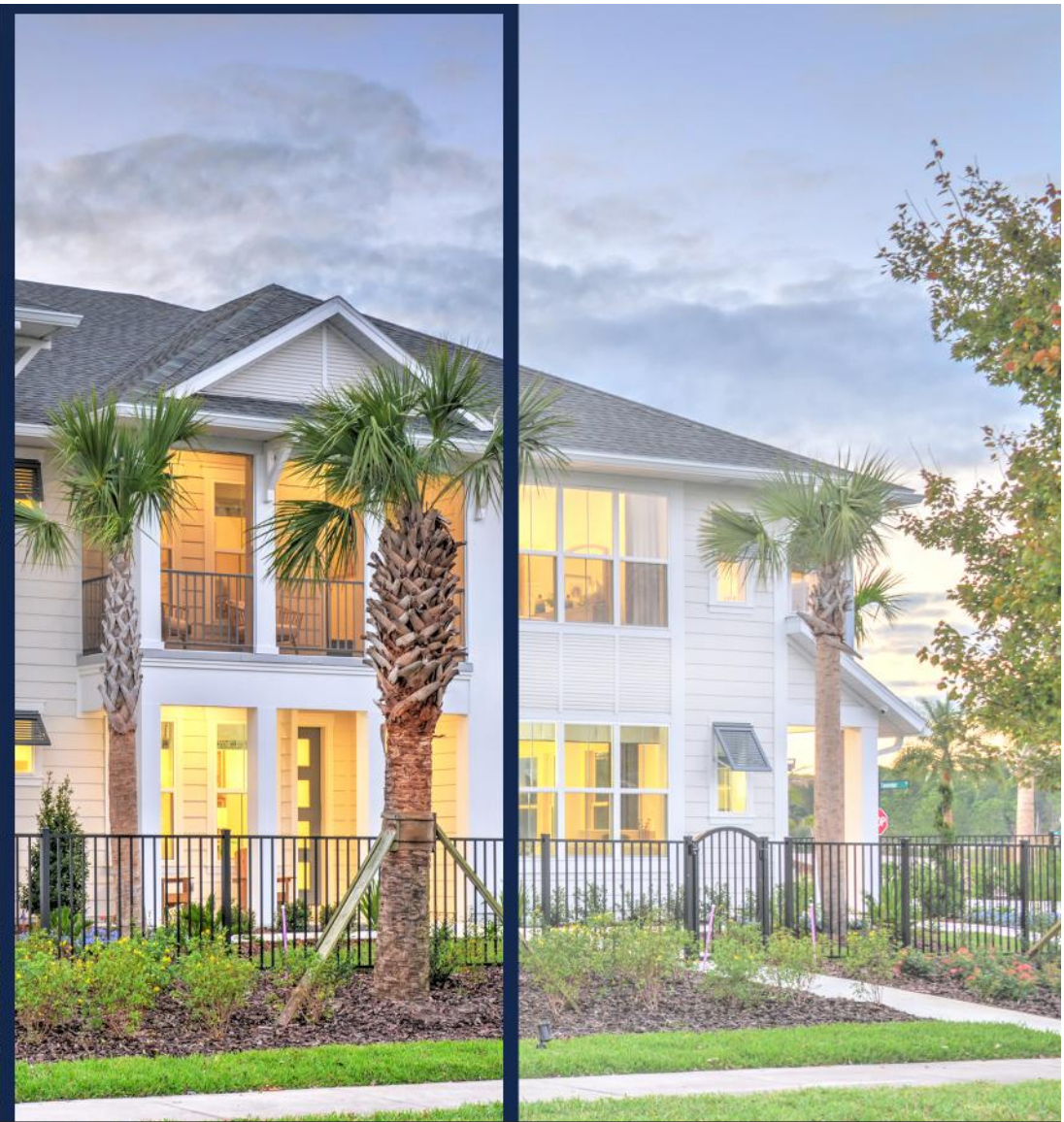
THE CASTILLO - WEST INDIES