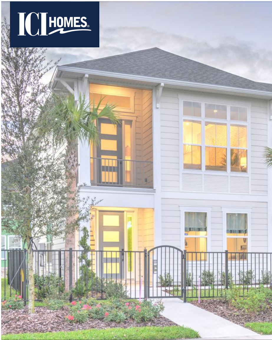
THE CASTILLO - C at NOCATEE