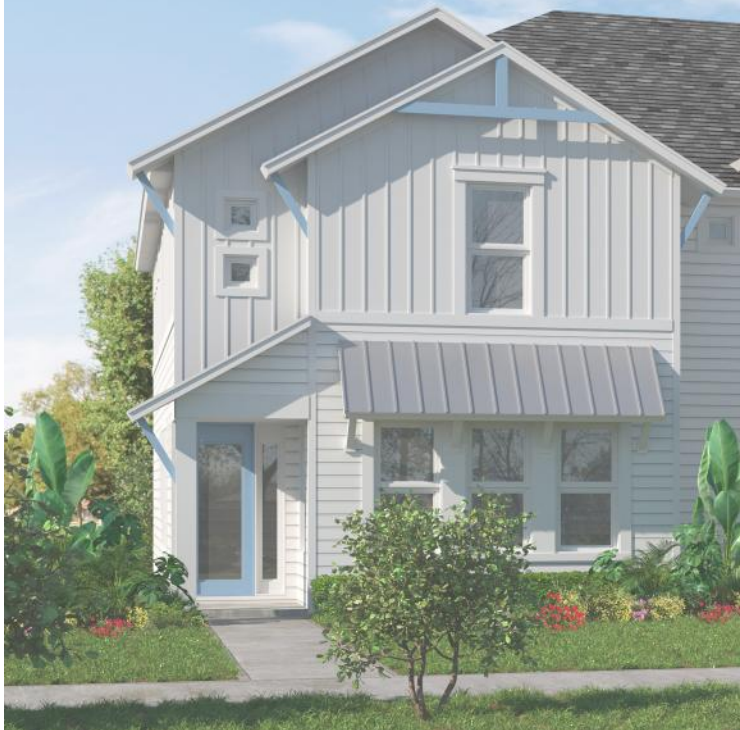
THE CASTILLO - C at NOCATEE