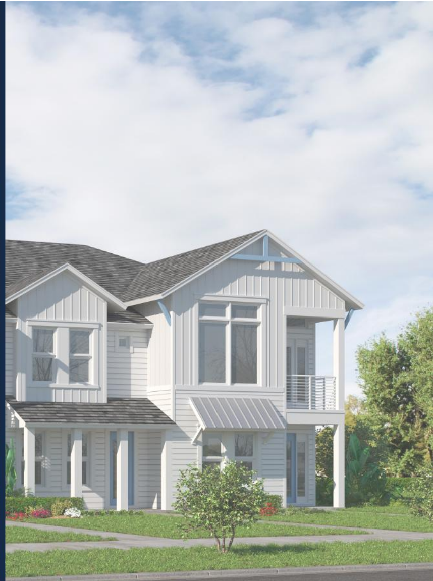
THE CASTILLO - C at NOCATEE