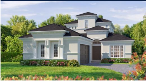
THE MEDITERRANEAN II - TILE